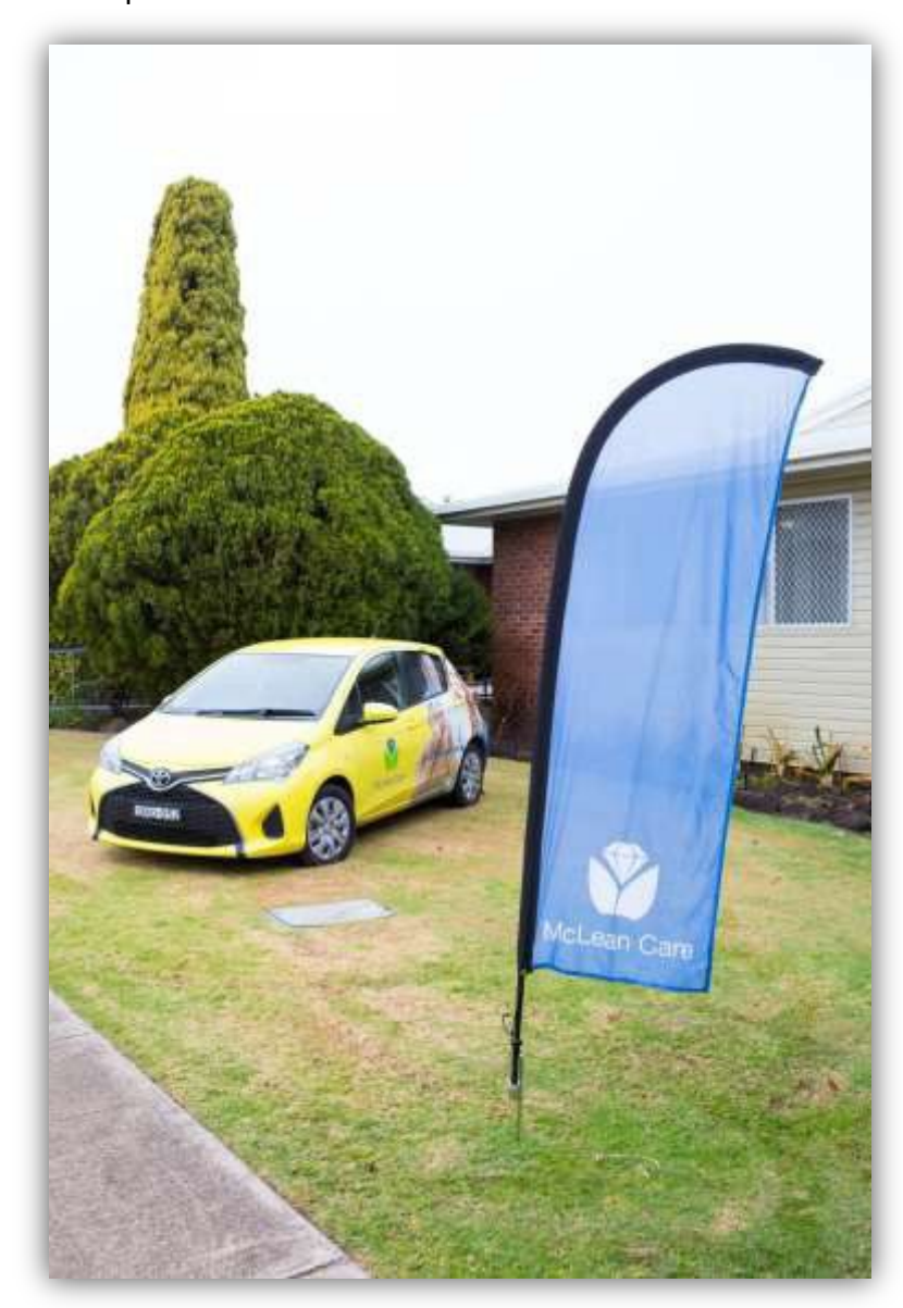
McLean Care At CWA House | McLean Care

From 1 July 2015, when a Resident moves from one room in the facility to another, the Residential Care Agreement will be varied to include the new agreed accommodation payment amount. The maximum permissible interest rate as at the date on which the new accommodation agreement is made is used to calculate the daily accommodation payment (DAP) on the new room price.